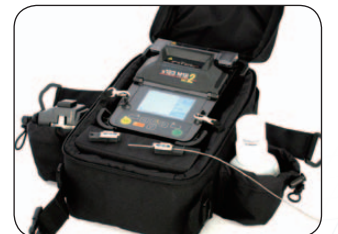
⑥ -2 Working Belt in Action