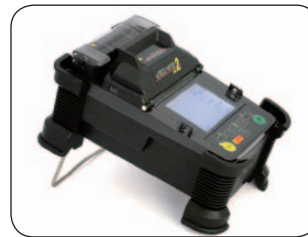
⑤ Angled Stand in Action