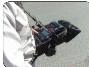
⑥ -1 Working Belt in Action