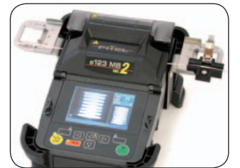
⑫ Fiber Transporter in Action