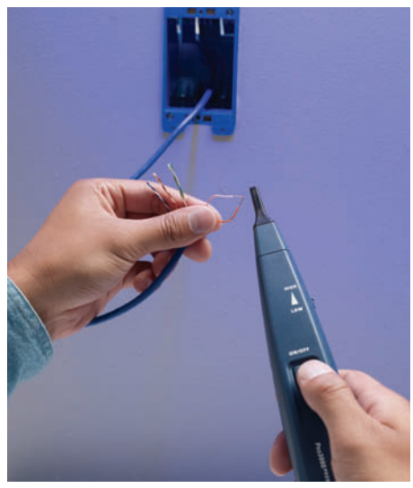
Hear the tone change when you short the correct pair on the far end