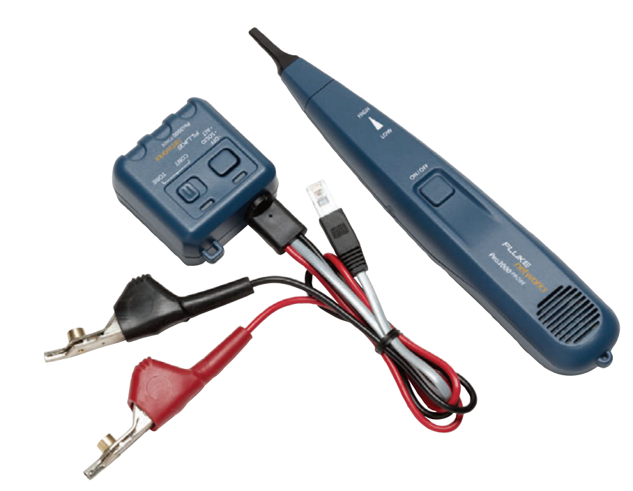
Pro3000 Toner and Probe

Use the SmartTone capability of the Pro3000 Tone Generator to identify the right pair. When touching the wires together and momentarily shorting the far end of a cable pair, the SmartTone technology will change the cadence of the tone generated. This tone change you hear through the probe positively verifies the correct wire pair. SmartTone provides five distinct tones for exact pair identification.