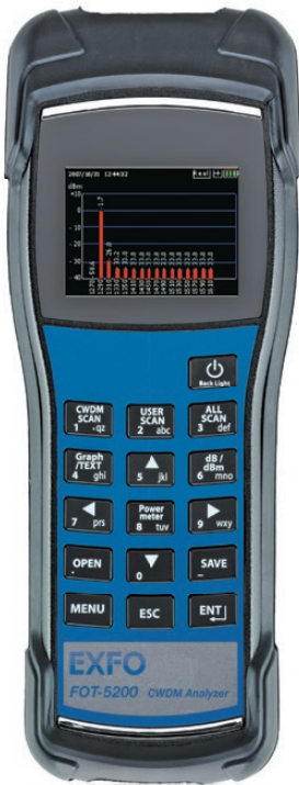
Front view of the FOT-5200