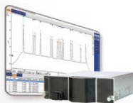
Optical Spectrum Analyzers FTBx-5245/5255