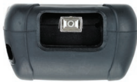
Top-side view of the FOT-5200