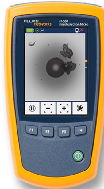
FI-500 displaying a dirty fiber endface