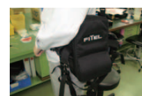
⑥ -2 Working Belt in Action