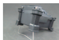
⑤ Angled Stand in Action