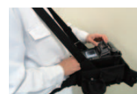
⑥ -1 Working Belt in Action