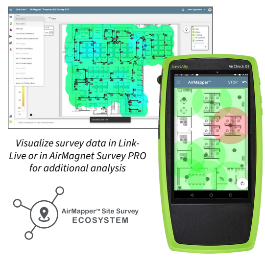
AirMapper Site Survey App on the AirCheck G3

*NOTE: Wi-Fi 6/6E regulatory compliance implementation of the 6GHz spectrum varies by country. AirCheck G3 models are available in three versions; see Models and Accessories for additional information.